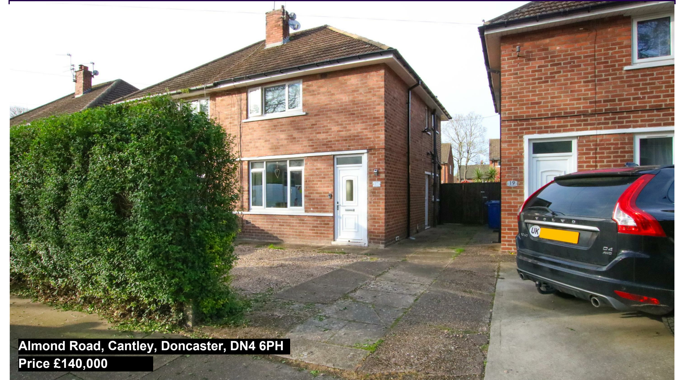
Almond Road, Cantley, Doncaster, DN4 6PH Price £140,000